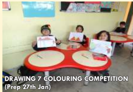
DRAWING & COLOURING COMPETITION (Prep 27th Jan)