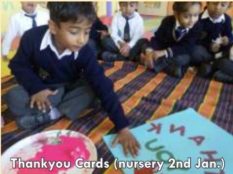
Thankyou Cards (nursery 2nd Jan.)

"I am a co-learner in the journey of self-discovery – I embark with my students in the process that we call "education."