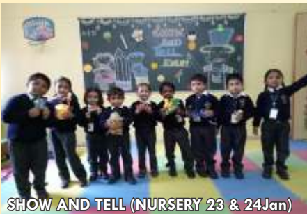
SHOW AND TELL (NURSERY 23 & 24Jan)

Annual Picnic was organized on 13th January 2017 for the tiny tots of Pre-Nursery and Nursery to Barsana, The Urban Village at S. G. Highway. The children were quite excited at the prospect of going out with their classmates and teachers. They enjoyed Magic show, Pottery and Rajasthani folk dance. The sumptuous food made the trip all the more enjoyable. It was fun to see our tiny tots dancing with gay abandon on the beats of DJ organized for them. All Pre-Nursery and Nursery teachers accompanied them.