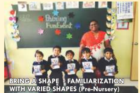
BRING A SHAPE - FAMILIARIZATION WITH VARIED SHAPES (Pre-Nursery)