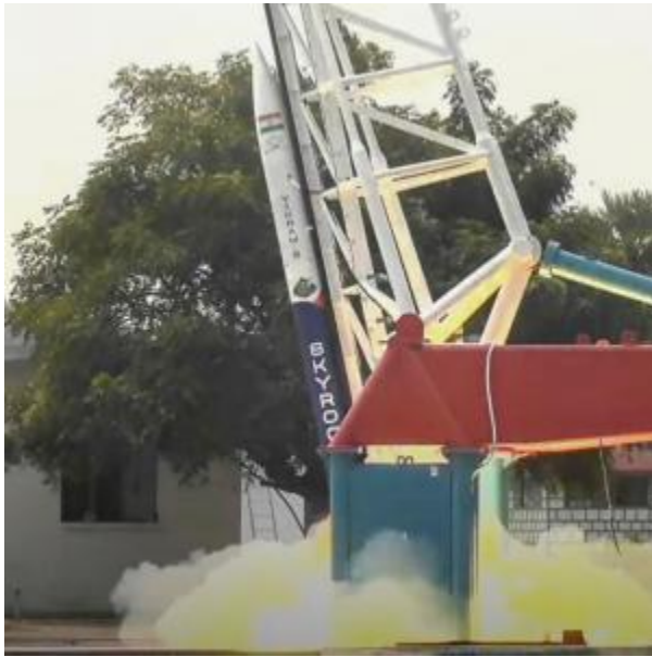
Vikram-S opens new doors for India's space programme