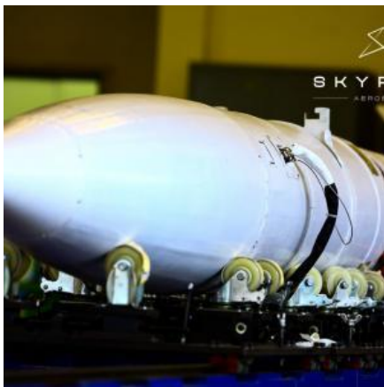
Vikram-S launch on Fri could be India's SpaceX moment