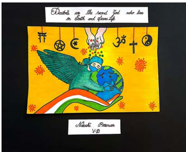
Niashi Parmar-Std.V-D ↑