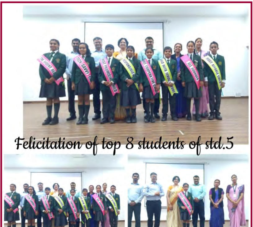
Felicitation of top 8 students of std.5