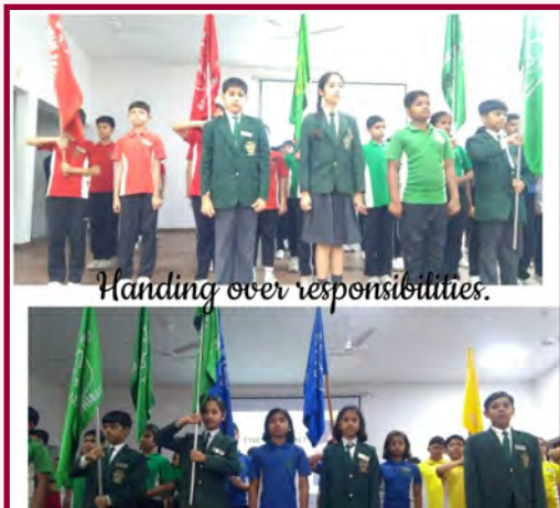
Handing over responsibilities.