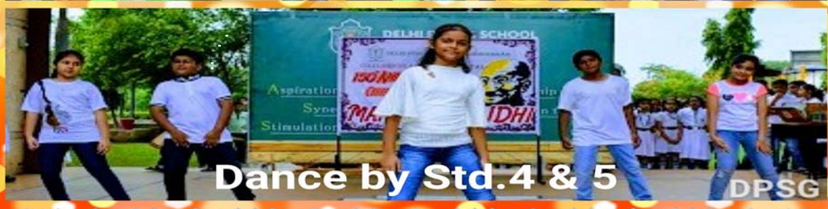
Dance by Std.4 & 5