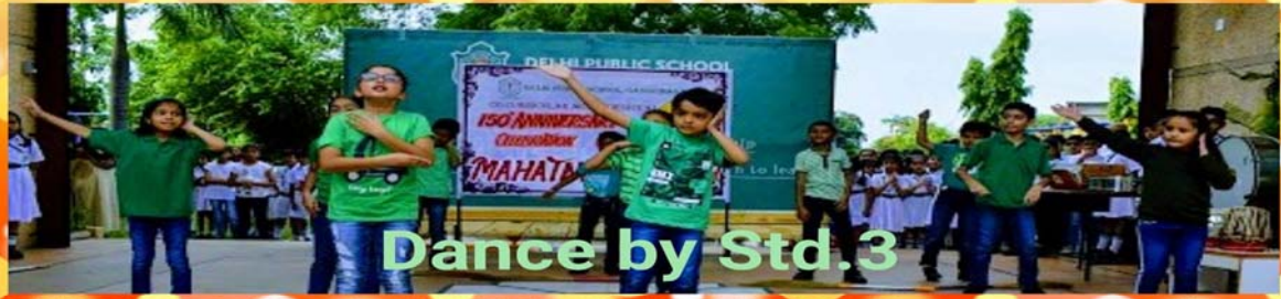
Dance by Std.3