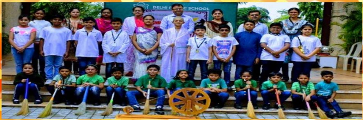
150th BIRTH ANNIVERSARY OF MAHATMA GANDHI